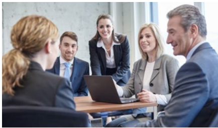
ARVATO AND VOIGT INDUSTRIE SERVICE